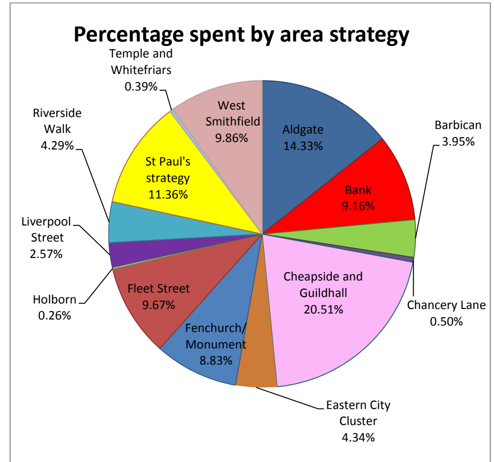
Chart 1 – Projected financial spend proportionally by Area Strategy

This indicated that overall the spend on implementing Environmental Enhancement Strategies has been spread across the City. Moving to the Community Infrastructure Levy as a source of funding to replace the more constrained Section 106 funding source will provide the opportunity to ensure that allocation meets need and priority rather than being so linked to a particular development.